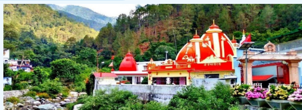
Kainchi Dham (142 km)

Experience a jeep safari in India's first national park and encounter wild tigers against a stunning Himalayan backdrop