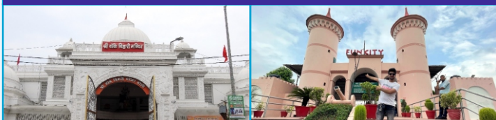
BANKE BIHARI MANDIR