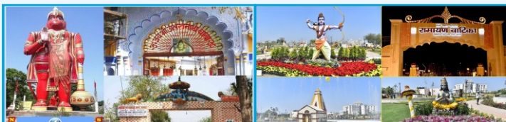
SHREE BABA ALAKHNATH TEMPLE