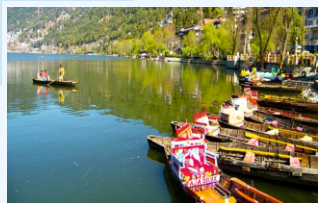
Nainital (141 km)

Boat on emerald lakes, trek scenic trails, and soak in Himalayan vistas