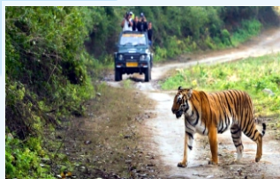
Jim Corbett National Park (143 km)

Boat on emerald lakes, trek scenic trails, and soak in Himalayan vistas